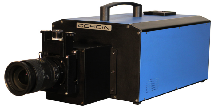
(Model 164 shown with optional objective lens)

Streak cameras record a thin, wide line of light signals at the fastest possible speeds. They capture subtle variations in intensity from a line image, a spread spectrum, or linear array of discrete signals with resolution down into the picoseconds.